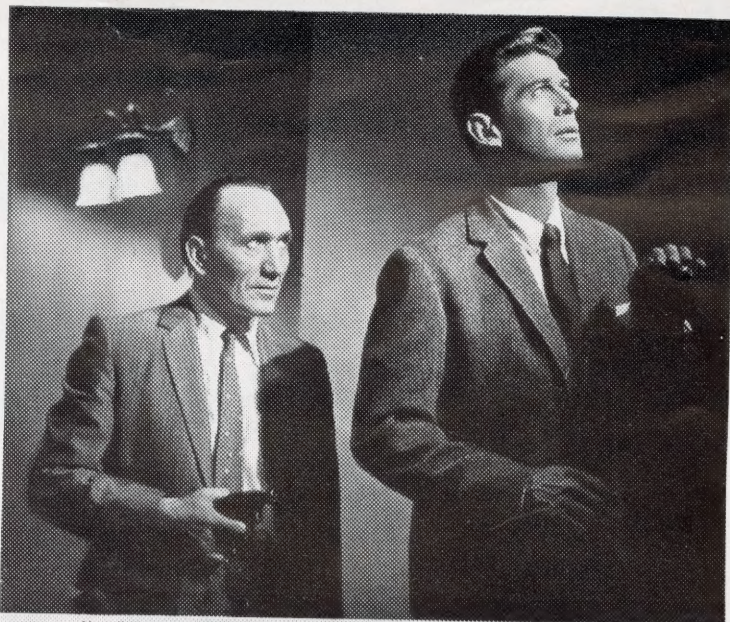
"APPOINTMENT WITH A SHADOW" (2-A)

Paul Baxter (GEORGE NADER), once a top reporter, but now on the alcoholic skids, gets a chance to redeem himself. From his girl friend, Penny Spencer (JOANNA MOORE) he learns that a notorious killer at large, Dutch Hayden (FRANK deKOVA) is being set up for capture by the police through his burlesque beauty sweetheart, Florence Knapp (VIRGINIA FIELD). Penny's brother, a police lieutenant (BRIAN KEITH), heads the cordon which is to take Dutch when he and Flo leave a restaurant, as pre-arranged. Paul is to witness the capture exclusively, thus get back on his paper. He sees the event, and the man with Flo shot and killed. But that man is a "plant," and the real Dutch Hayden sees the killing from the same rooftop. Paul escapes him by diving over a wall. He tries to tell Spence, but is spurned, and in turn becomes the hunted. Hayden gets Flo to bring Paul to his place at gunpoint, forces him to the roof, tries to make him jump to